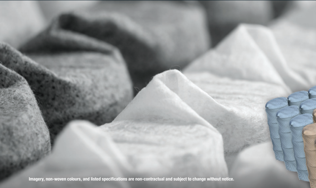
Imagery, non-woven colours, and listed specifications are non-contractual and subject to change without notice.

Create a unique and compelling comfort story with Anatom ® , the ultimate zoning application.