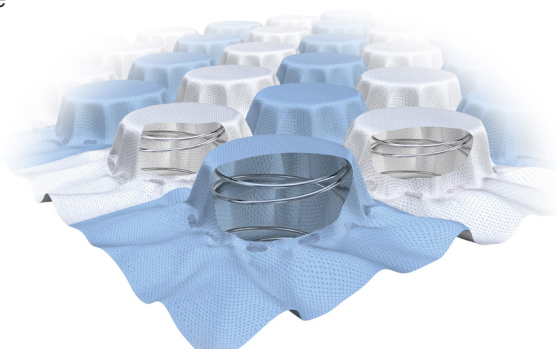
Alternating chequerboard design