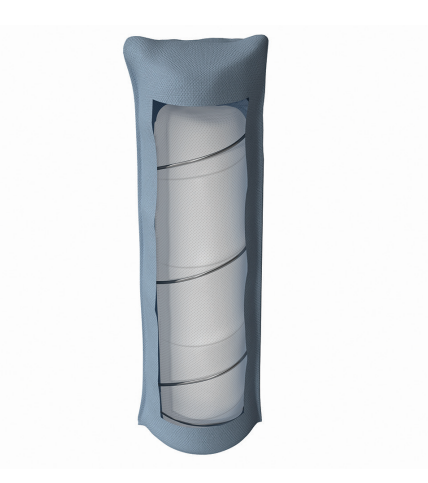
Joey® coil-within-a-coil pocket springs