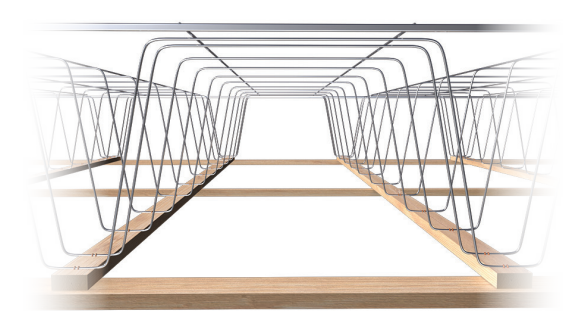
Semi-Flex® Performance Grid