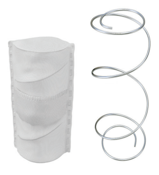
Pre-compressed, next-generation S-Line pocket springs