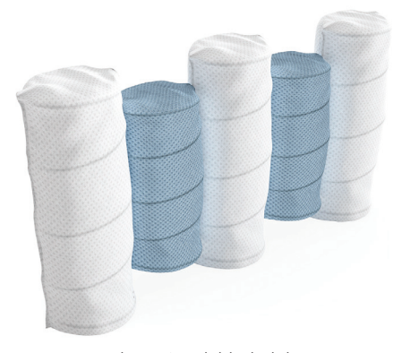
Hi-Low® variable-height pocket springs