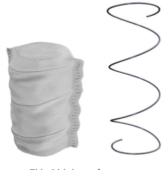
Ekko® high-performance pocket springs