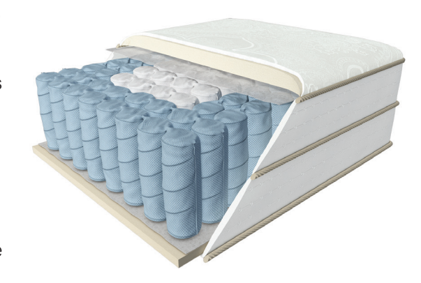
Supportive Caliber Edge® dynamic spring perimeter