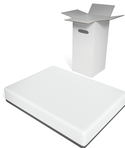
Compressed Finished Mattresses