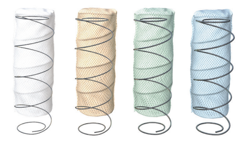
Configure your own solution with multiple firmness levels